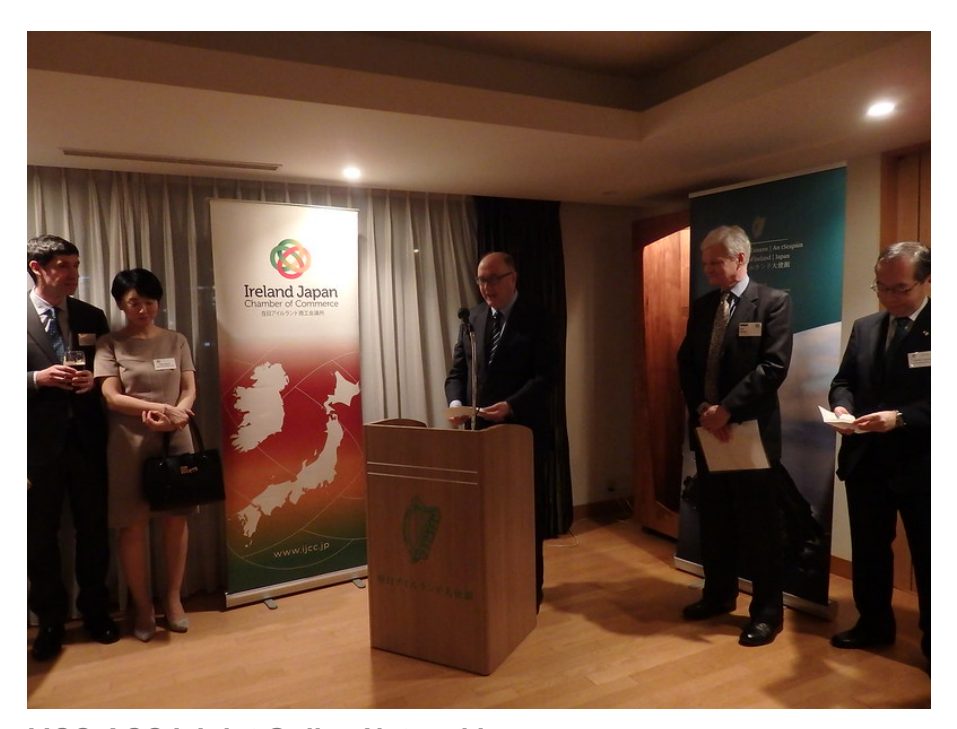
IJCC-ACCJ Joint Online Networking